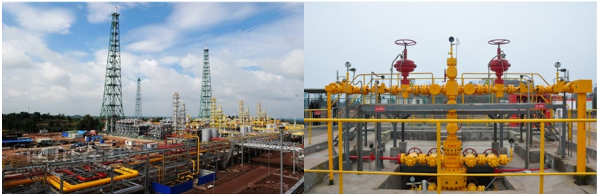
The Moxi gas plant

The Moxi plant selected AP Sensing's fiber optic-based DTS solution for downhole oil and gas applications. Two, single channel DTS units were acquired for the downhole wells and installed together with 8 km of sensor cable.