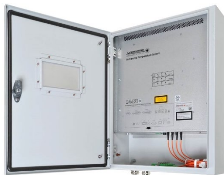
Outdoor housing model

AP Sensing (Shanghai) Co., Ltd – a Chinese subsidiary – worked in cooperation with China National Petroleum Corporation (CNPC) and our regional partners. The planning, installation, commissioning and training were completed in 2019.