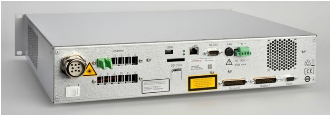
2-Channel Linear Power Series Instrument Integrated LAN & USB Interface, SD Card Reader and 20 Relays Output

In parallel, the AP Sensing Power Management Software Suite provides an easy to see “Graphical Thermal Profile” and logs all temperature traces into an SQL database for post processing and analysis.