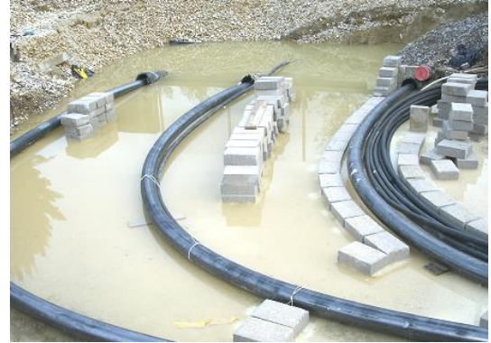
Road Crossing / Horizontal Drilling

In 2010 a new 380KV power circuit (north / south axis) was put into operation as part of a nationwide power grid improvement. Near Florence the high voltage circuit has buried sections in close proximity to a very populated valley and a historic church. The primary route was completed in trenches filled with thermal sand. The project also included challenging road crossings that used horizontal drilling to complete the construction.