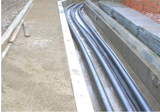
Cable Section in Trench