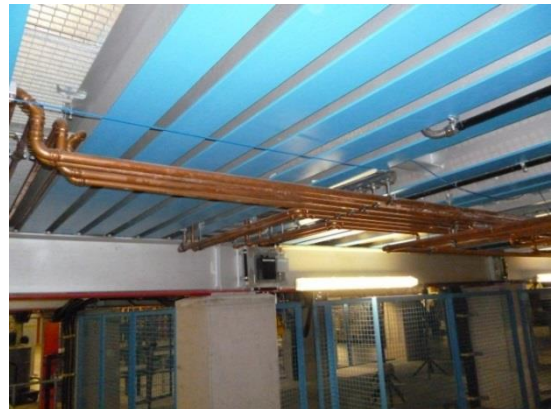
Sensor fiber installed along the production line route