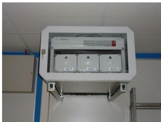
Linear Heat Series DTS device in operation

With the AP Sensing solution, valuable assets remain protected with all the advantages of a rugged, modern DTS system: no area is left unmonitored and the sensor cable is not affected by dirt, smoke, or EMI. The customer is already well into the planning stages for a 2 nd DTS installation.