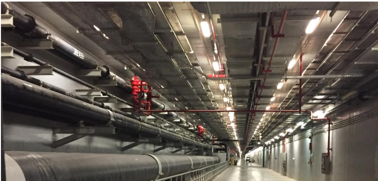
Utility tunnel with cable trays on the ceiling

Since 2011, AP Sensing has been monitoring the cable trays of several medium-voltage (typ. 33 kV) electrical power distribution cables located in the underground electrical cable galleries. Due to line-of-sight issues of traditional thermography services, it is difficult to achieve a full survey that covers inaccessible tunnel areas containing power cables. For this reason, the client selected AP Sensing's LHD solution. Our system completely monitors the cable trays of all MV electrical power cables every minute of the day with automatically-generated alarms to instantly alert facility managers and provide the location of a potential fire or hotspot for further action.